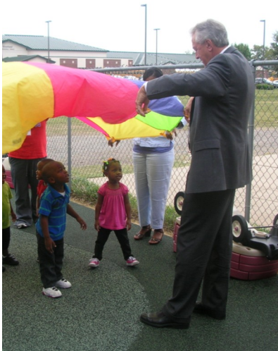
Congressman Rodney Alexander visits VOA Twin City Early Head Start Program